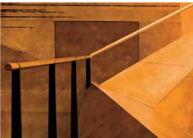
Handrails - steel core imbedded in raw timber.