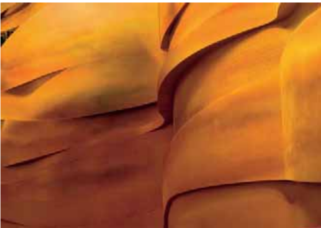
Waved walls with extreme high mass per unit area.