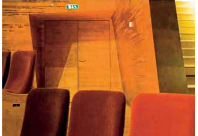
Custom-made fire-rated doors.