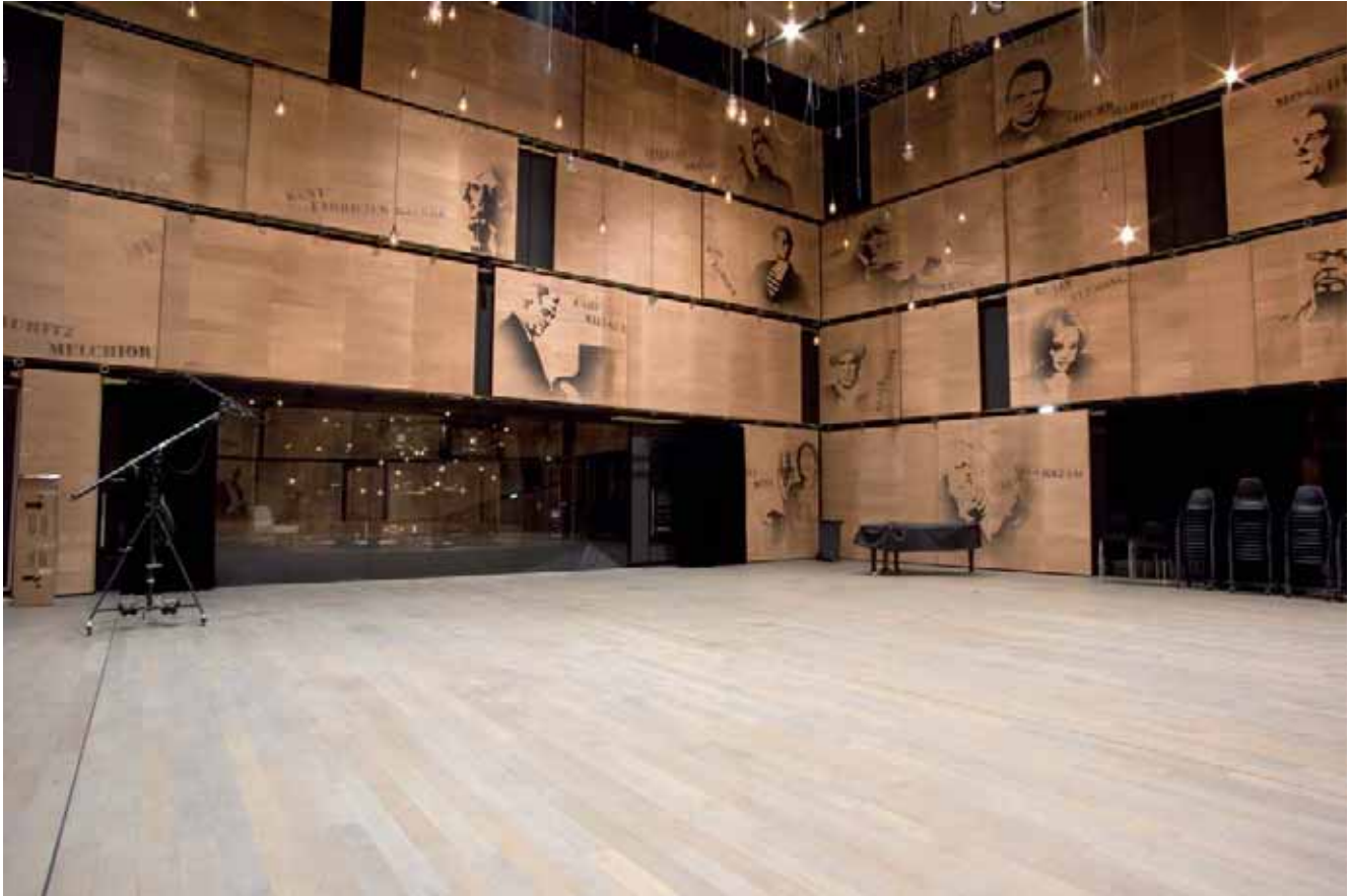
Lindner supplied and installed high-quality wooden floors in the three small studios 2, 3 and 4.