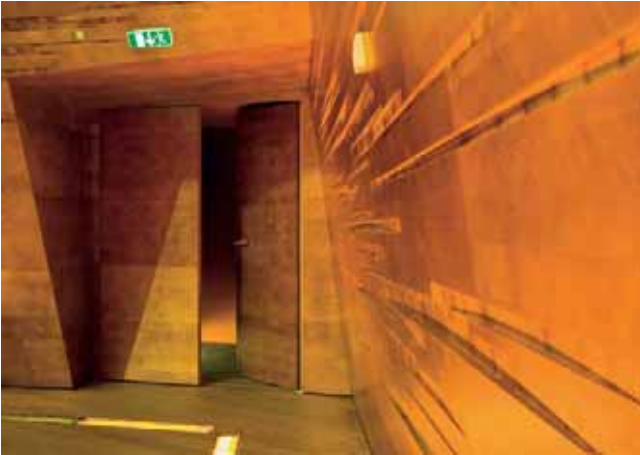
Prefabricated wall panels; each piece uniquely microshaped.

“The architecture asserts itself through details - doors, lighting, ceilings, and staircases - a testimony of respect for the buildings’ visitors, concertgoers, and artists.” Jean Nouvel