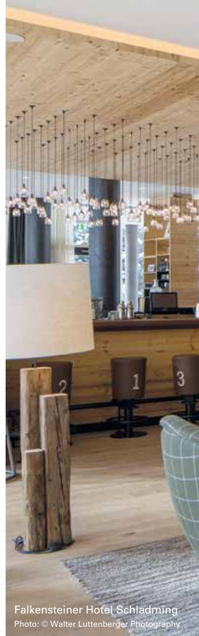
Falkensteiner Hotel Schladming

Anyone visiting an unfamiliar place wants to feel at home in their hotel – day and night. If the ambience goes down well with guests, they feel perfectly comfortable.