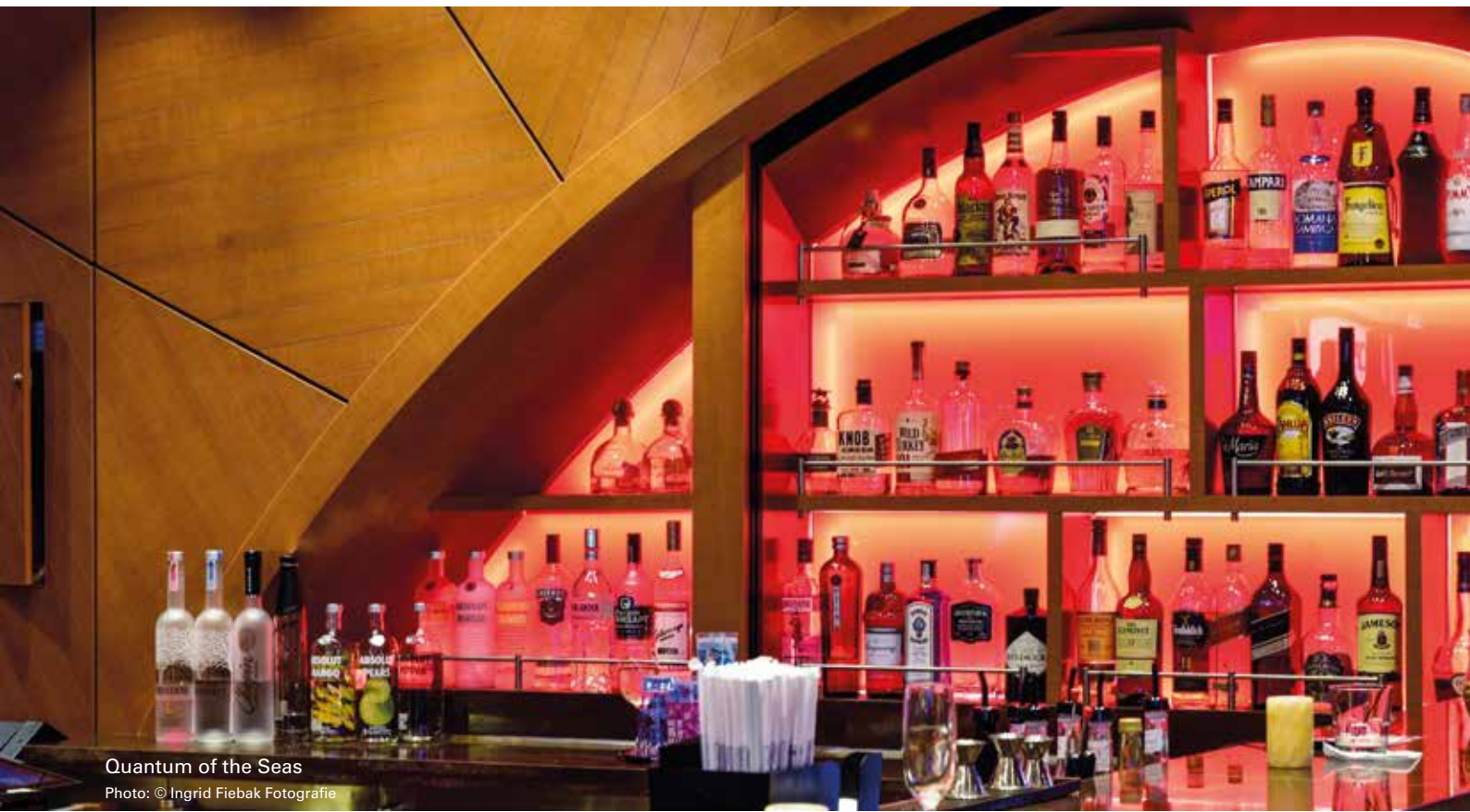
Quantum of the Seas