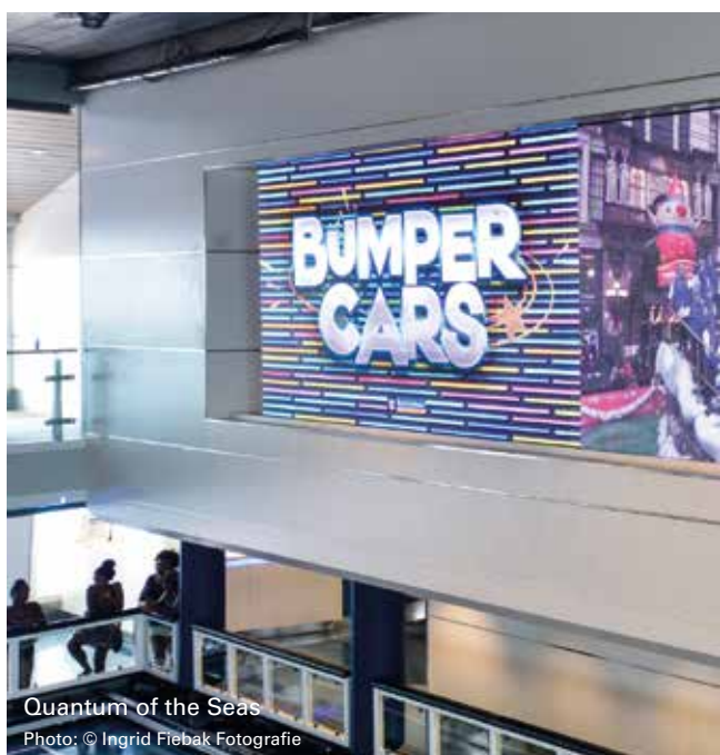
Quantum of the Seas