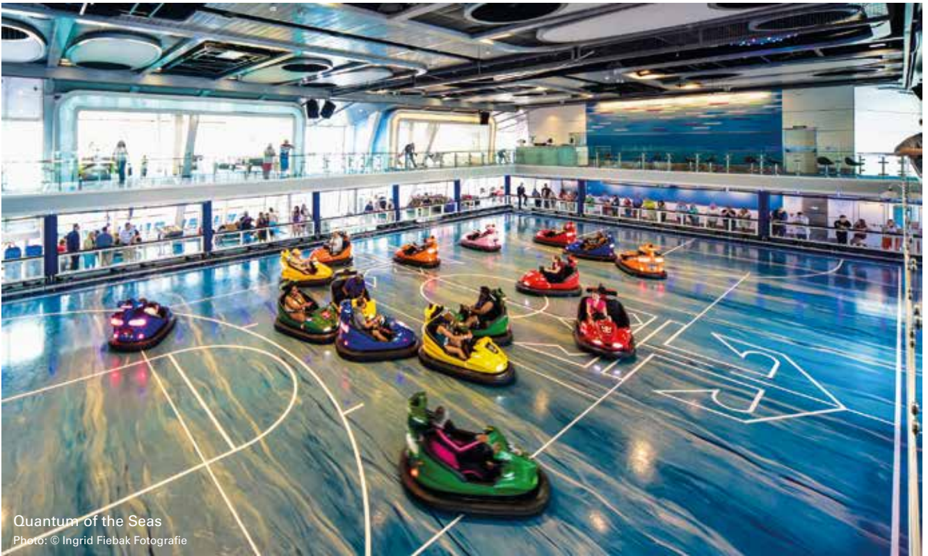
Quantum of the Seas