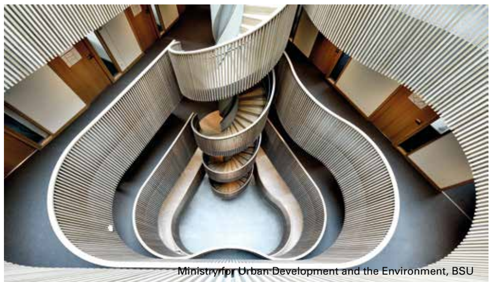
Ministry for Urban Development and the Environment, BSU

We plan the complete project management together with you and draw up an absolutely efficient support plan. This minimizes your coordination work and avoids frictional losses. We will be happy to help you within the scope of an active partnership, right through to a turnkey execution, with application-optimized Lindner Concepts, proven Products and bespoke Services. Because we want to assist your project entirely to your individual wishes, you can commission as many or as few of our services as you want.