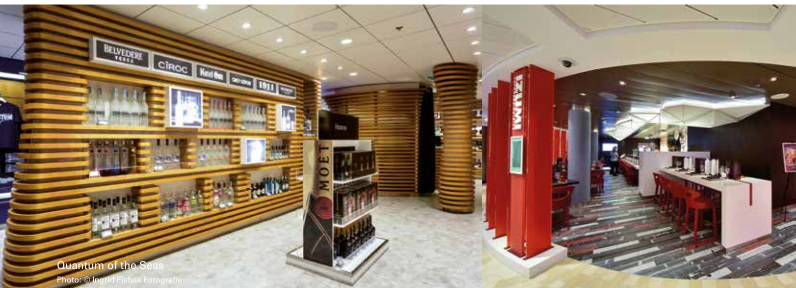
Quantum of the Seas