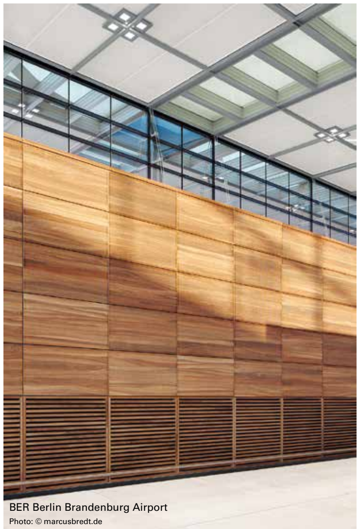
BER Berlin Brandenburg Airport

FIREwood is a successful combination of fire safety, acoustics and elegance.