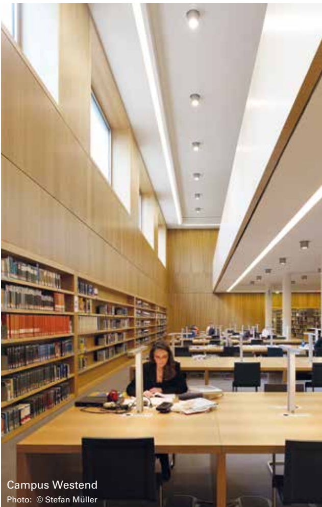
Campus Westend