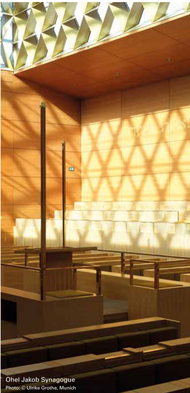
Ohel Jakob Synagogue

These Lindner products are characterised by their outstanding building physics properties – thus giving you maximum flexibility for your interior design. They are not simply a combination of different materials; rather, their unique compound structure satisfies different requirements, such as fire safety, acoustics and design. They are produced in a certified process in our own production units.