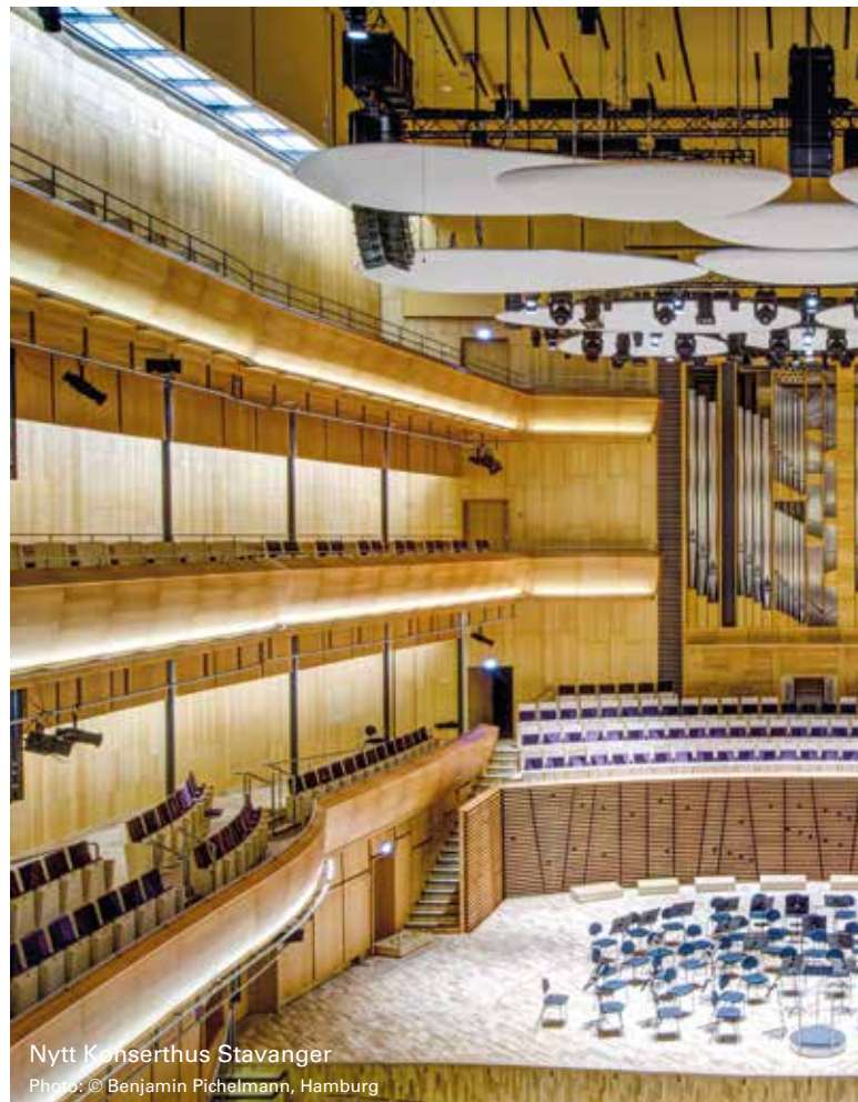
Nytt Konserthus Stavanger