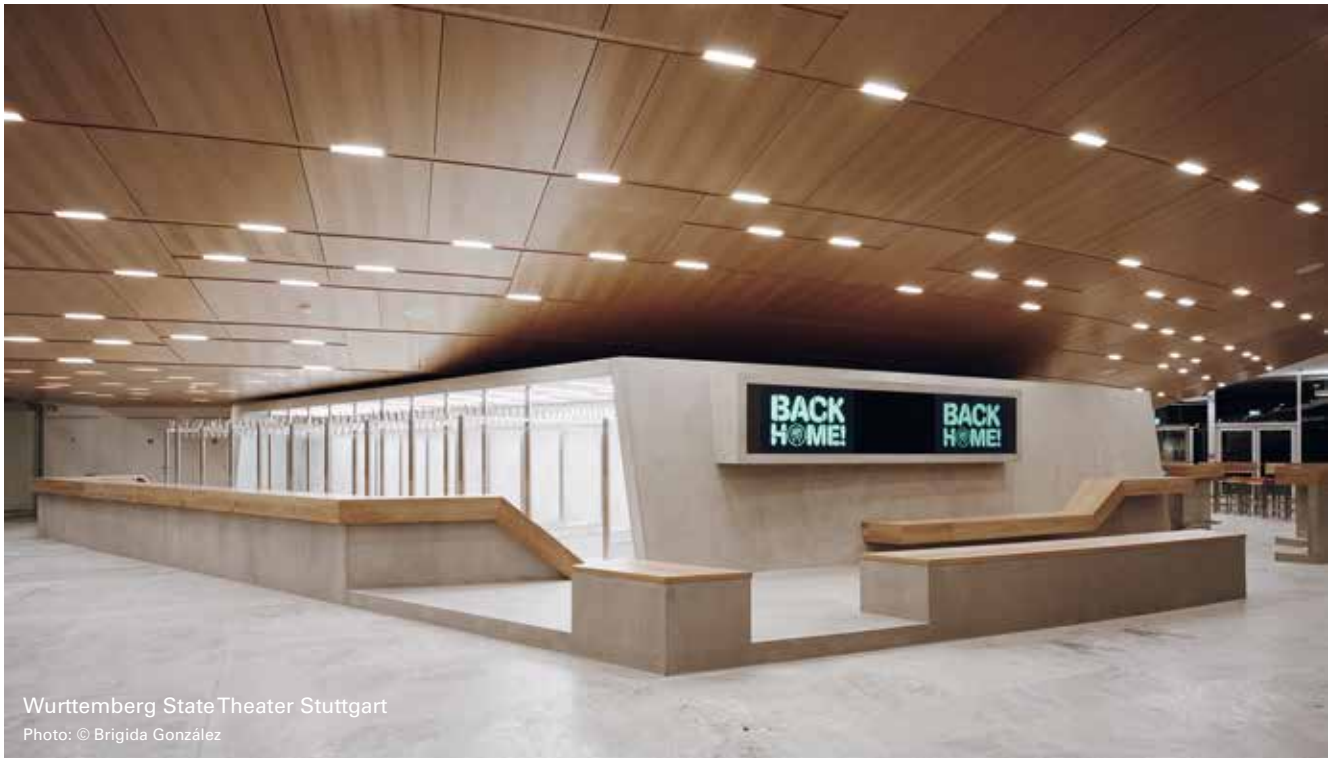
Wurttemberg State Theater Stuttgart

You want to finish rooms in real wood and at the same time have to satisfy high fire safety requirements such as „low-flammability“ or „non-combustibility“?