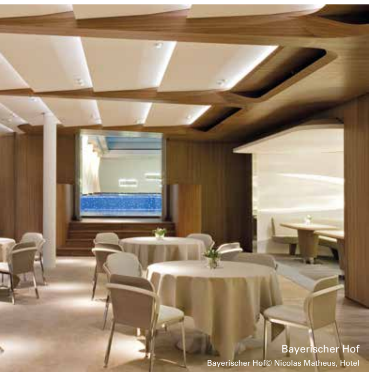
Bayerischer Hof Bayerischer Hof

Lindner Hotels and Resorts covers the entire range of services that have to be rendered for interior fit-out in the field of hospitality during every phase of a project. Our goal is to provide precisely those services that lead to the best result for the customer in cooperation with everyone involved on site.