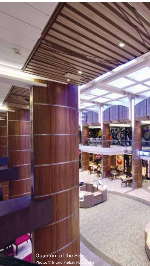
Quantum of the Seas

Would you like to learn more about Lindner Maritime? We will be pleased to send you more detailed information.