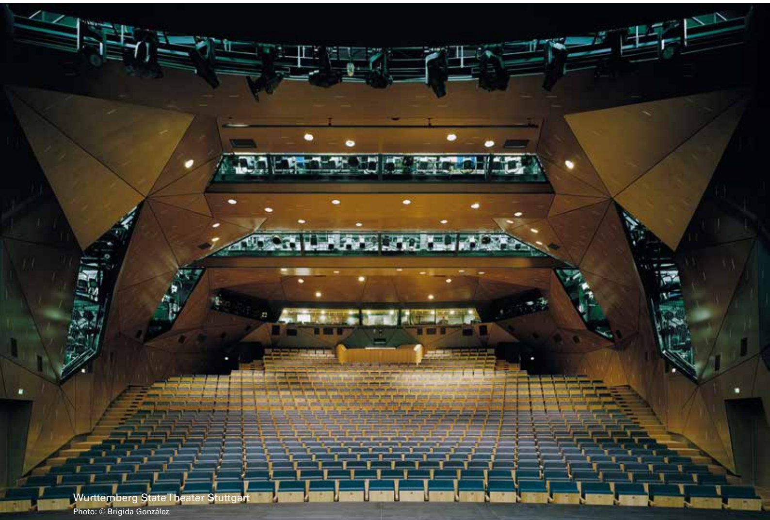
Württemberg State Theater Stuttgart

FIREwood stands for a range of composite fire safety panels, right through to non-combustible, ready-to-fit panels.