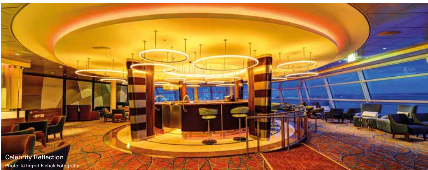
Celebrity Reflection

What's more, we supply other companies at the shipyards directly with high-quality products from our own manufacturing facilities.