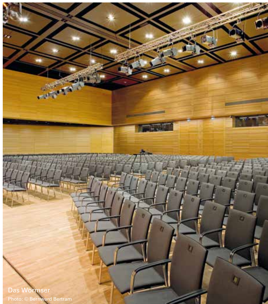
Das Wormser