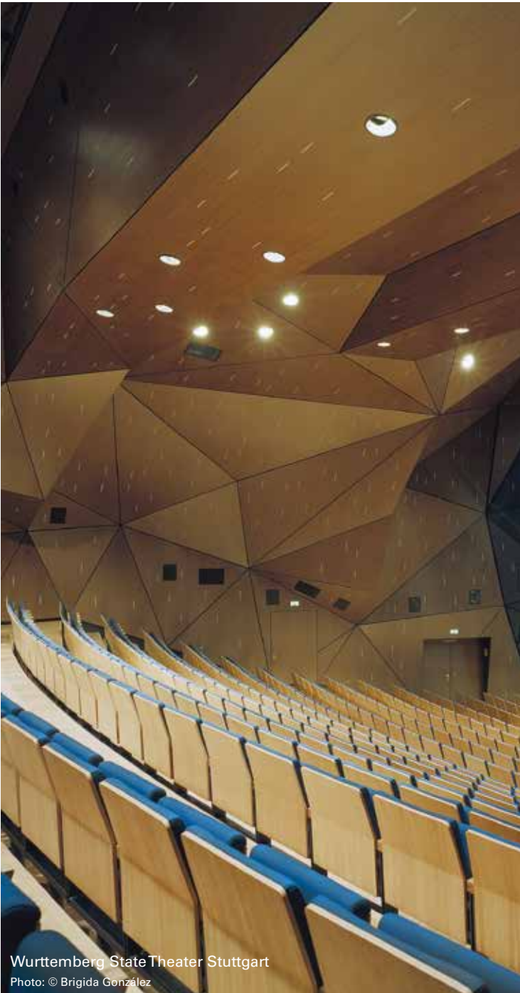
Wurttemberg State Theater Stuttgart

You have the vision. We'll make it real.