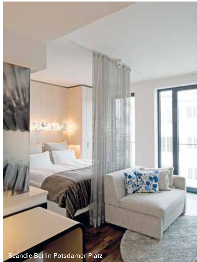
Scandic Berlin Potsdamer Platz

The Green Building team accompanies projects throughout the entire construction phase. The processes during production and on the construction site are hereby optimised with a view to sustainability; suppliers and manufacturers are systematically integrated in the improvement of the Green Building processes and the documents and records needed for certification obtained.