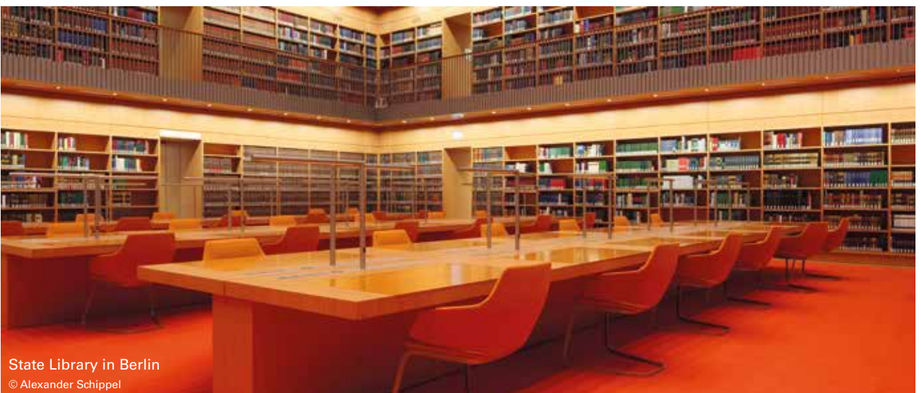
State Library in Berlin

If rooms have a representative task, the perfect blend of function and aesthetics is particularly important. We prepare an integrated concept together with you for the perfect conversion of your wishes, for example with respect to acoustics and furnishing. What's more, we provide all of the other services from one source too – for particularly efficient processes with no superfluous interfaces.