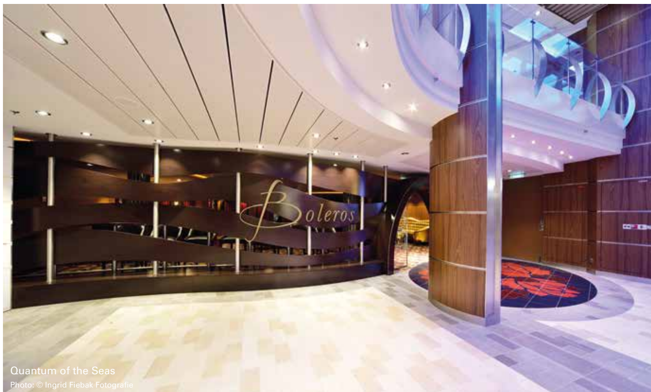
Quantum of the Seas

Modern architecture combines functionality and aesthetics with the greatest safety possible. Our designers, technicians and engineers ensure the perfect conversion of your ideas – so that there are no limits to your creativity.