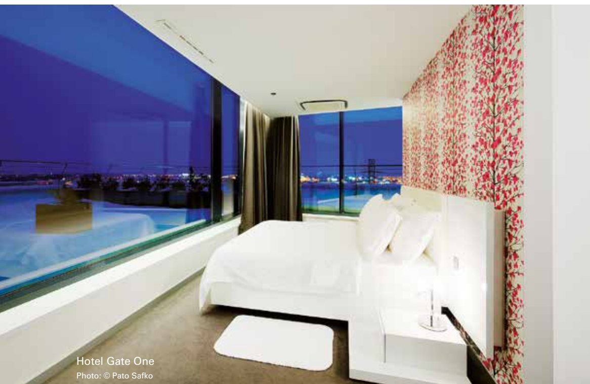
Hotel Gate One