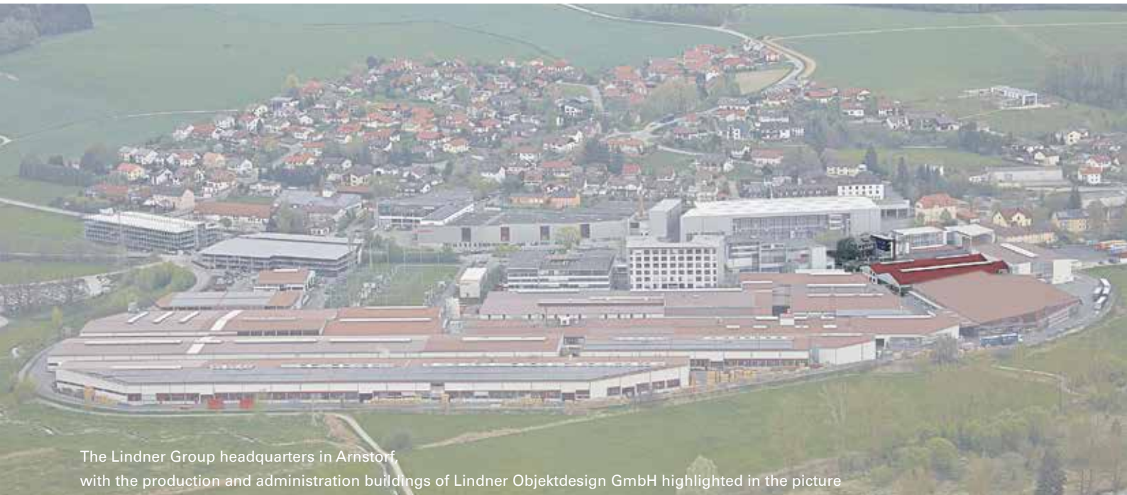
The Lindner Group headquarters in Arnstorf, with the production and administration buildings of Lindner Objektdesign GmbH highlighted in the picture

Lindner develops and manufactures customized products which will bring your concepts to life. This way, we can guarantee that wood does not burn and new floors can be walked on after only one day, for example. Because our motto is: anything is possible.