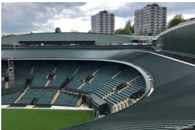
Wimbledon No. 1 Court

Lindner Group, P. O. Box 1180, 94424 Arnstorf (DE), Phone +49 (0)8723/20-0, Fax +49 (0)8723/20-21 47, www.Lindner-Group.com , info@Lindner-Group.com