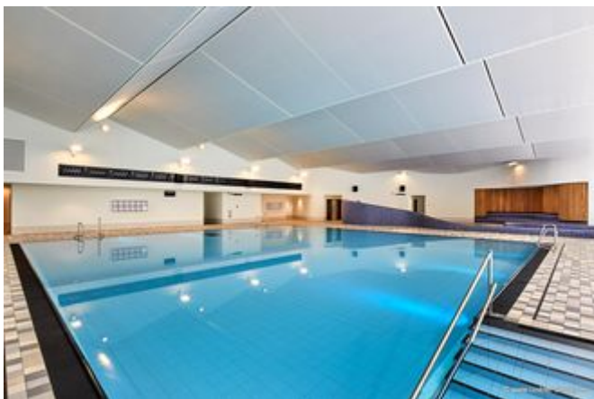
Public Swimming Pool in Ohlsdorf

Lindner Group, P. O. Box 1180, 94424 Arnstorf (DE), Phone +49 (0)8723/20-0, Fax +49 (0)8723/20-21 47, www.Lindner-Group.com , info@Lindner-Group.com